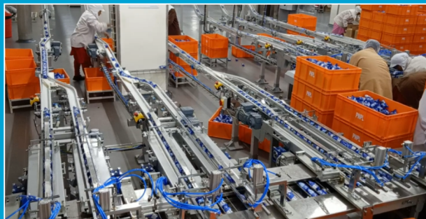
► Oreo Biscuit Packaging