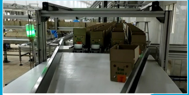
► Ice Cream Packaging & Handling