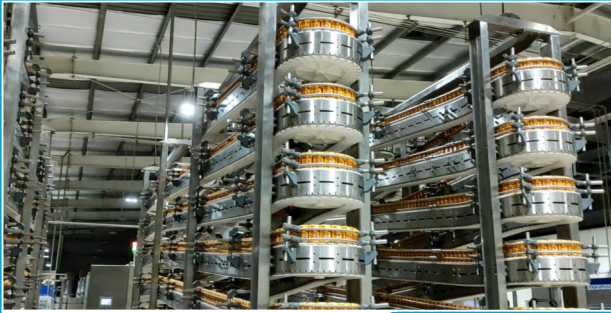
► Buffer for Packaging