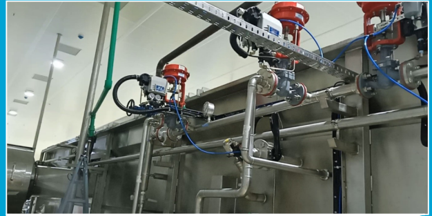
► Process of Sweet Corn (Blancher Machine)