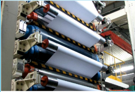
▶ Calendar Machine