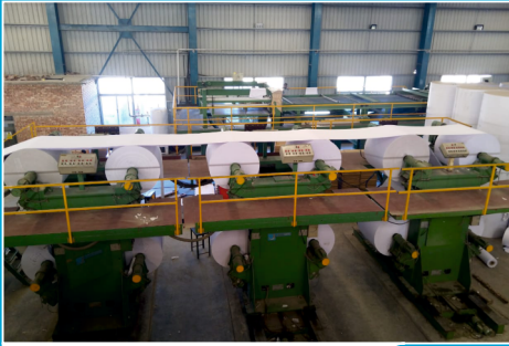
▶ Auto Tension Control