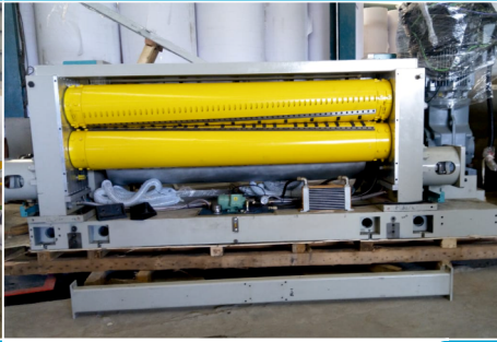
▶ Electrical Synchro Sheeter