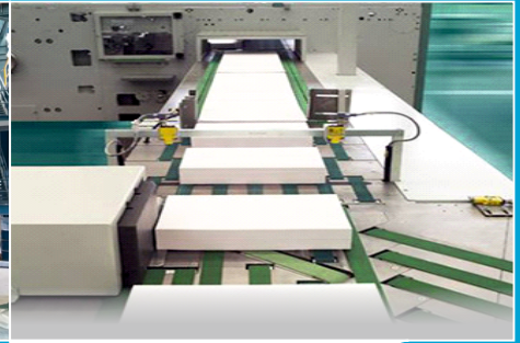
▶ A-4 Cutter