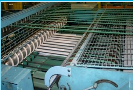
▶ Mechanical Synchro Sheeter