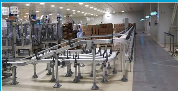
► Hindustan Unilever Sri Lanka