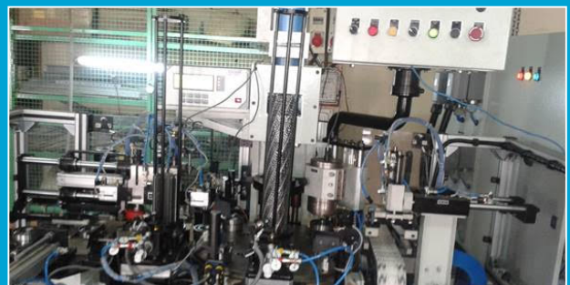
► SKF Malaysia