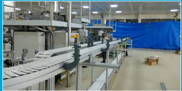
► SPM & Packing