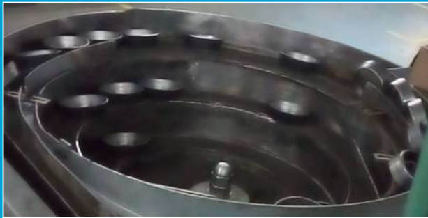
► Cage Punching