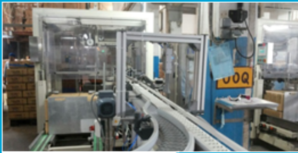
► SPM & Packing